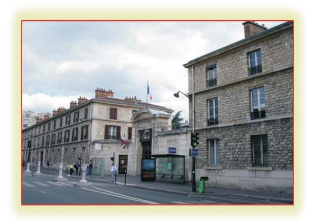
First_pediatric hospital in London

Is a French teaching hospital, located in Paris, France.